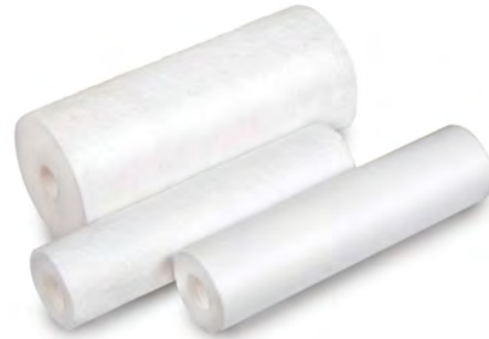
MB Series melt blown cartridge filters are manufactured with a tight self-supporting inner matrix, eliminating the need for a separate core

MB Series cartridges are made entirely of FDA 21CFR 177.1520 compliant polypropylene which provides exceptional chemical compatibility to handle a wide range of process fluids. MB Series cartridges offer economical filtration with flow rates of up to 5 gpm per 10" length and a maximum operating temperature of 180° F. MB Series cartridges are designed for knife-edge seal housings without the use of gaskets or seals. A wide variety of end cap options are also available.